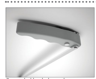
Concealed back door release